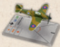
WGS403A HAWKER HURRICANE MK.I (303 POLISH SQUADRON)