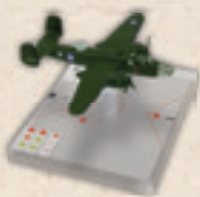
WGS302A NORTH AMERICAN B-25B MITCHELL (DOOLITTLE)