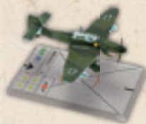
WGS404A JUNKERS JU.87 B-2 (STURZKAMPFGESCHWADER 77)