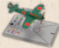
WGS108B NAKAJIMA KI-84 HAYATE (IMOTO)