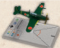
WGS103B KAWASAKI KI-61-II (ICHIKAWA)