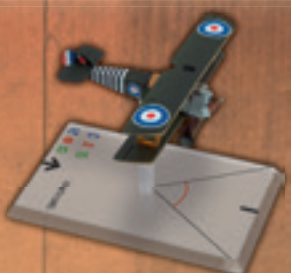
WGF102 SOPWITH CAMEL