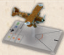
WGS110B FIAT CR.42 FALCO (RINALDI)