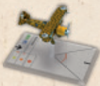
WGS110A FIAT CR.42 FALCO (GORRINI)