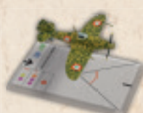
WGS104B REGGIANE RE.2001 CN FALCO II (CERRETANI)