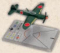
WGS204B YOKOSUKA D4Y1 SUISEI (KOKUTAI 121)