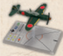
WGS204C YOKOSUKA D4Y3 SUISEI (KOKUTAI 601)