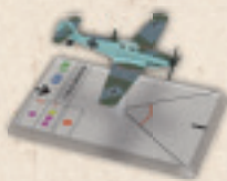
WGS402A MESSERSCHMITT BF. 109 E-3 (JAGDGESCHWADER 2)