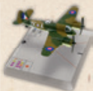
WGS201B BEAUFIGHTER MK.IF (HERRICK)