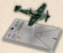
WGS112A MESSERSCHMITT BF.109 K-4 (9./JG3)