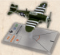
WGS111A REPUBLIC P-47D THUNDERBOLT (MOHRLE)