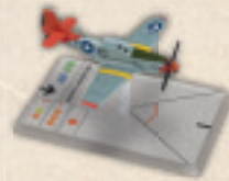
WGS107C P-51D MUSTANG (ELLINGTON)