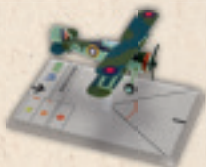
WGS109A GLOSTER SEA GLADIATOR (BURGES)