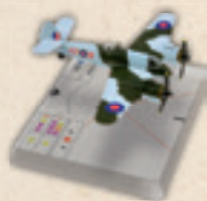
WGS201C BEAUFIGHTER MK.VIF (DAVOUD)