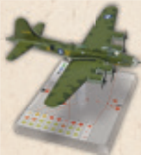
WGS303A B-17F "MEMPHIS BELLE"