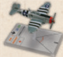
WGS111C REPUBLIC P-47D THUNDERBOLT (RAYMOND)