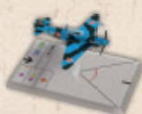
WGS102B YAKOVLEV YAK-1 (LUGANSKI)