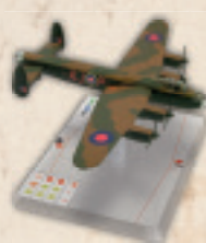
WGS304B AVRO LANCASTER B MK.III "DAMBUSTER"