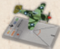
WGS101B CURTISS P-40F WARHAWK (LOTT)