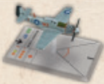
WGS107A P-51D MUSTANG (LANDERS)