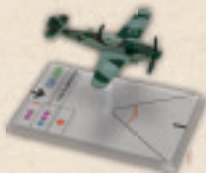
WGS112B MESSERSCHMITT BF.109 K-4 (1./JG77)