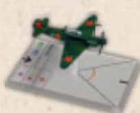
WGS102A YAKOVLEV YAK-1 (LITVJAK)