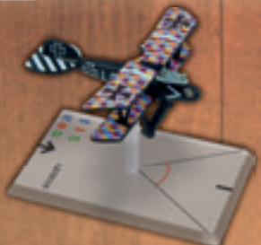
WGF103 ALBATROS D.VA