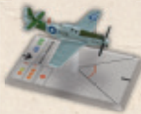
WGS107B P-51D MUSTANG (SAKS)