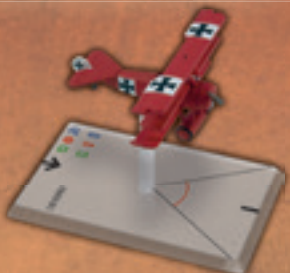
WGF104 FOKKER DR.I