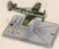
WGS105B FW-190 D-9 (WÜßKE)