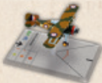
WGS109B GLOSTER GLADIATOR MK.I (PATTLE)