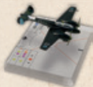
WGS202C BF.110 C-4 (RADUSCH)