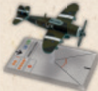
WGS111B REPUBLIC P-47D THUNDERBOLT (RAF 135 SQUADRON)