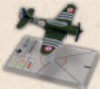
WGS203B DOUGLAS A-24B BANSHEE (RUET)