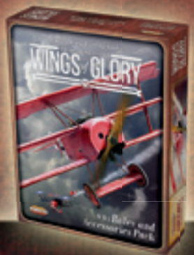
WGF002A WW1 RULES AND ACCESSORIES PACK

Find the complete collection of WW1 Airplane Packs, Special Packs and Accessories at www.aresgames.eu/games/ww1-wings-of-glory-line .