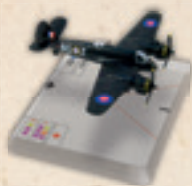
WGS201A BRISTOL BEAUFIGHTER MK.IF (BOYD)