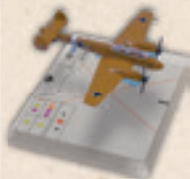
WGS202B BF.110 C-7 (CHRISTL)