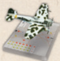
WGS301B HEINKEL HE. 111 H-5 (1./KG53)