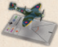
WGS106A SPITFIRE MK.IX (BEURLING)