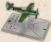
WGS105A FW-190 D-13 (GÖTZ)