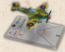
WGS106C SPITFIRE MK.IX (CSALSKI)