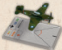
WGS101A CURTISS P-40E WARHAWK (HILL)

M any more Airplane Packs and Special Packs are available to expand your WW2 Wings of Glory games. Each of these Airplane Packs and Special Packs features one airplane fighting during WW2, and all of them are 100% compatible with your Battle of Britain Starter Set and airplanes. Find out how to customize and balance scenarios when using airplanes with widely different capabilities by downloading our point system from www.aresgames.eu/download .