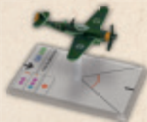
WGS112C MESSERSCHMITT BF.109 K-4 (HARTMANN)