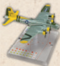
WGS303B B-17G "A BIT OF LACE"