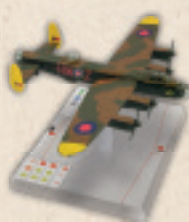
WGS304A AVRO LANCASTER B MK.III "GROG'S THE SHOT"