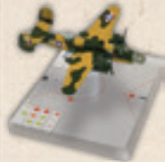
WGS302B NORTH AMERICAN B-25C MITCHELL (BAUER)