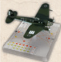
WGS301A HEINKEL HE. 111 H-3 (STAB./KG53)