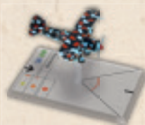
WGS110C FIAT CR.42 CN FALCO (GRESSLER)