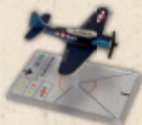
WGS203C DOUGLAS SBD-5 DAUNTLESS (KIRKENDAHL)