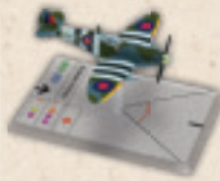
WGS106B SPITFIRE MK.IX (JOHNSON)