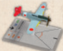
WGS103A KAWASAKI KI-61-II (NAKANO)