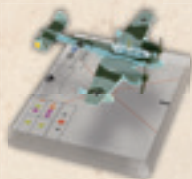
WGS202A BF.110 C-4 (SCHUPP)