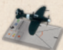
WGS104A REGGIANE RE.2001 FALCO II (METELLINI)