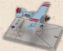
WGS109C GLOSTER GLADIATOR MK.I (KROHN)