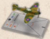
WGS401A SUPERMARINE SPITFIRE MK.I (G10 SQUADRON)

This Wings of Glory Battle of Britain Starter Set is your gateway to play with a great range of airplane models! You may expand your Battle of Britain games with these additional Airplane Packs , featuring airplanes from the early years of the war. Each pack includes a ready-to-play model – painted and assembled – and all you need to play: gaming base, altitude stand, maneuver deck. Squadron Packs also include a decal sheet to customize your airplane, and Special Packs include additional rules and components.