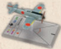
WGS108A NAKAJIMA KI-84 HAYATE (FUJIMOTO)