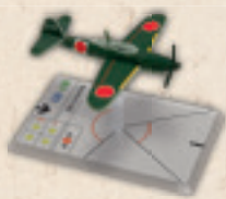
WGS204A YOKOSUKA D4Y1 SUISEI (YOKOSUKA KOKUTAI)