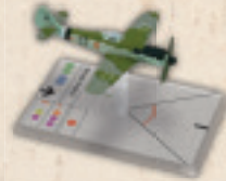
WGS105C FW-190 D-9 (7./JG 26)