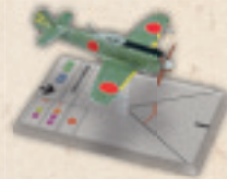
WGS108C NAKAJIMA KI-84 HAYATE (SZENTAD)